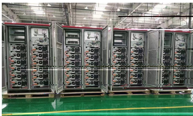
Figure 1: Project Photos

Located in 5 industrial parks, the 25 sets of JinkoSolar's SunGiga liquid cooling storage system (ESS) coupled with renewable energy contribute to grid stability. In addition, the high price of electricity during peak period in Guangdong Province brings a considerable amount of electricity expenses to enterprises, so these 5.375 MWh products play a key role in peak shaving and valley filling.