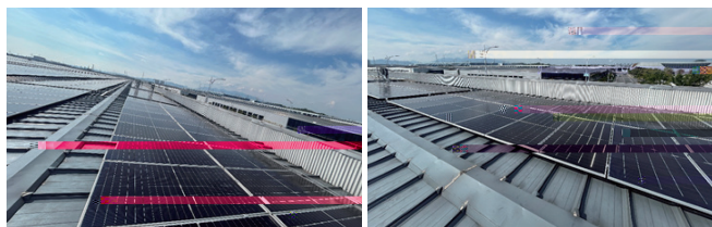
: Project Picture

BC modules are assumed to be ideal for rooftop installation because of their higher front-side power relative to TOPCon module. Meanwhile, the bifaciality disadvantage of BC cells can be minimized in rooftop scenarios. Therefore, this study compared the performance of TOPCon PV modules and BC modules to determine their energy yield in real-world conditions and their potential for rooftop applications.